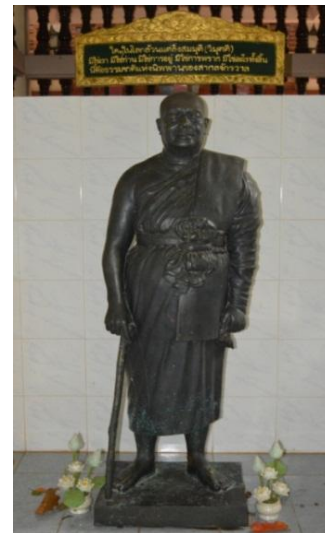
Fig. X: Buddhadasa Bhikkhu's Statue within Sala Dhamma Ghosana Pavilion [15]

Floating bones in river and scattering on mountain are concerned with Dhamma puzzle. It just signifies that body returns to the nature. It becomes to four elements, namely earth, water, fire, and wind. It is the way to learn Dhamma from the nature and a real normal life.