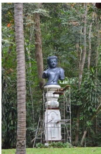
Fig. IX: Avalokiteshavara Bodhisattva's Statue [14]

The reason that Buddhadasa Bhikkhu exhibits Bodhisattva's statue at monastery is that concerned with belief of Srivijaya Kingdom, the old kingdom of Chaiya city which believes in Mahayana Buddhism before. Also, his idea is strongly influenced by Zen Mahayana. Mahayana believes in Bodhisattva and practice goodness in order to become the Bodhisattva. Then, the basic concept of Mahayana emphasizes on Paññā and Mettā to help people escaping from sufferings more than finding the way like Theravada which emphasizes on the purity by escaping from sufferings himself first, then help people later.