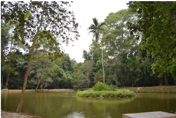
Fig. XII: Nalike Pond [17]

Beside of the hall for meals it has a pathway to one of the important place at Suan Mokkh. Here is Nalike Pond which is in rectangle area and one hundred meter in width and two hundred meters in length. The pond is covered by algae. In the center it has a small island around five square meters where is overspread by grass. The sole coconut tree about twenty to thirty meters grows up there. It has an explanation that 'there is a memorial of earnest Dhamma practice of grandparents in ancient time, in Thai old lullaby states that: Nalike coconut tree is lonely in the sea of beeswax. No rain, no thunder, stay in middle of sea of beeswax. It will be reached there by sage man only. The meaning is that Nibbana is present amidst samsara.'