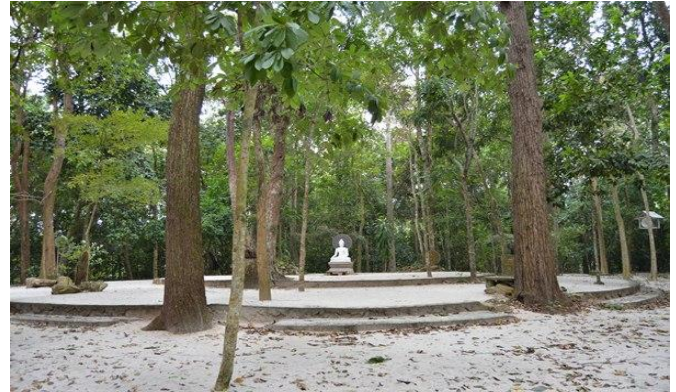
Fig. VI: Natural Uposatha [10]

colors is behind it. At the feet of altar appears the messages that 'for remembrance of half of century of Suan Mokkh in B.E. 2525 (A.D. 1982).' In addition, it has pillars to demarcate the land of Uposatha according to the Vinaya (rules) for construction.