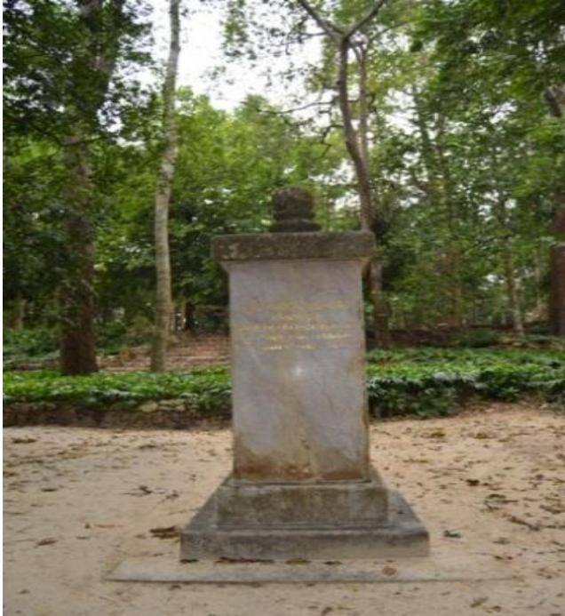
Fig. V: Body Burning Memorial [9]

at the top. It has four aspects and each one is fifty in width and one and fifty meter in length. Each aspect is written in four different languages, if walking along clockwise direction, i.e. Pāli, English, Thai, and Chinese. In the pillar it appears the messages as followings: here is the cremation of Buddhadasa Bhikkhu (Phra Dhamma Kosacariya), corresponding on 28 th September, 1993 on Tuesday, the 13 th of waxing moon in the 10 th of lunar month.'