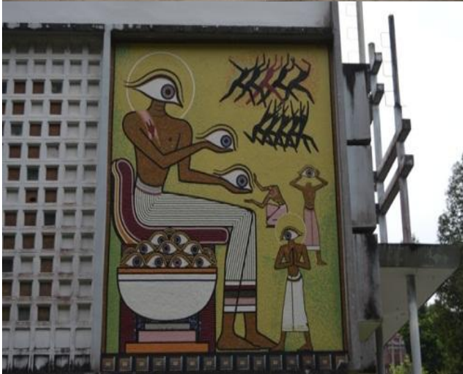
Fig. III: Spiritual Theater and Picture of Distributing the Dhamma Eyes [5]

Spiritual Theater is a new tendency in Buddhist architecture towards creating non-hierarchical sites for the teaching of Buddhist doctrine through aesthetic experience and leisure practices. [6] It is approximately ten meters in width and one hundred meter in length. Outside wall of building is curved by set of the Buddha's story and beside of building is arranged by group of rocks. It has two floors. On the 1 st floor it has seven groups of Dhamma puzzle paintings as follows: 1) paintings of butterfly, dog, and deity that show around pillars of the building; 2) paintings form Monk Emanuel Sherman, American Zen Master that hang on the inner wall; 3) paintings of world and philosophy that hang on the inner wall; 4) paintings of proverbs around the pillars; 5) paintings of tales about the Dependent Origination (Paticcasamuppāda) that place on the stage in the middle of building; 6) paintings of Kaya Nagara (city of body) that hang on the inner wall; and 7) paintings of Zen that hang on the inner wall.