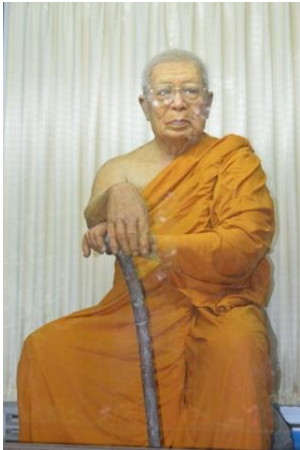
Fig. VIII: Buddhadasa Bhikkhu's Statue within Kutī Acariya Building [12]

you look at Avalokiteshavara's face and then it will make us feel comfortable.'