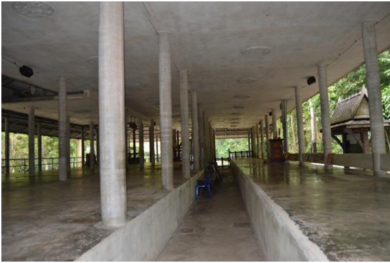
Fig. XI: A Hall for Meals [16]

Beside of the hall for meals it has a pathway to one of the important place at Suan Mokkh. Here is Nalike Pond which is in rectangle area and one hundred meter in width and two hundred meters in length. The pond is covered by algae. In the center it has a small island around five square meters where is overspread by grass. The sole coconut tree about twenty to thirty meters grows up there. It has an explanation that 'there is a memorial of earnest Dhamma practice of grandparents in ancient time, in Thai old lullaby states that: Nalike coconut tree is lonely in the sea of beeswax. No rain, no thunder, stay in middle of sea of beeswax. It will be reached there by sage man only. The meaning is that Nibbana is present amidst samsara.'