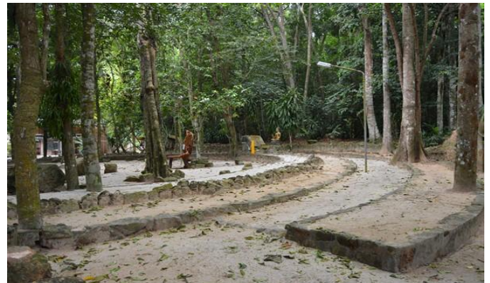
Fig. II: Curved Stone Court [4]

A lot of signs show the meaningful places at monastery, one of them is Curved Stone Court which has an explanation that 'it is one symbol of Suan Mokkh which is most suitable for practicing Dhamma; it is reflection of Buddhadasa Bhikkhu's ideal on what he needed people to practice at Suan Mokkh through talking with a tree and stone and learning conditioned things (Sangkhata Dhamma) and unconditioned things (Asangkhata Dhamma); nowadays here is the place for demonstrating alms giving, chanting, preaching, and meditating; all activities will start at 4:30 a.m.'