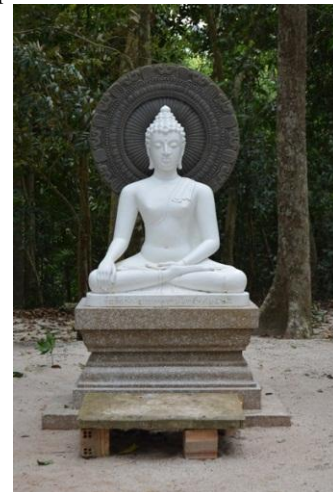
Fig. VII: White Buddha's Statue within Uposatha [11]

The sign of monastery explains that 'it is the ground Uposatha along the nature like in Buddha's lifetime, around by the trees are wall, white clouds in the sky are ceiling, the treetops shaking along the wind are alive gable apexes. This place is for doing monks' services, considering all precepts, and candle light to walk clockwise proceedings. The lower ground is the place to burn Buddhadasa Khikkhu's body.'