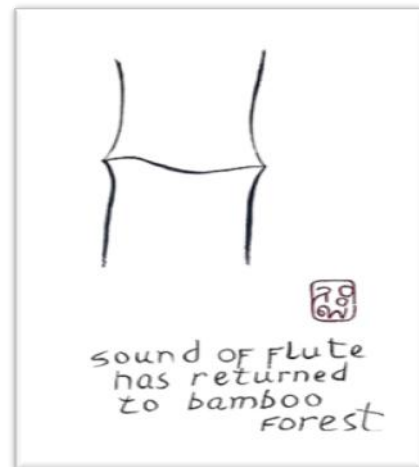
Fig. IV: Painting of Sound of Flute [8]

All paintings or pictures are simply arranged. Some have explanation as poetry. First painting is dominant at the front entrance of building named 'sound of flute has returned to bamboo forest.' Buddhadasa Bhikkhu explained in poetry as following translation: 'Sound of flute has returned to bamboo forest. Please think about this message, bamboo that is cut to make a flute and have a good flute sound. Sound is returned to bamboo, it is as strong as it is fluted, like steam rising from the sea becomes a cloud and rains back to the sea. Like a desire that carries people to the world, when it ceases the power of birth, it runs into land of purity, do not wander somewhere. A state of disorder has come to emptiness. It is no way to go anywhere. In final, it ceases what has been done. So ceasing (emptiness) is essential of the Dhamma.' [7]